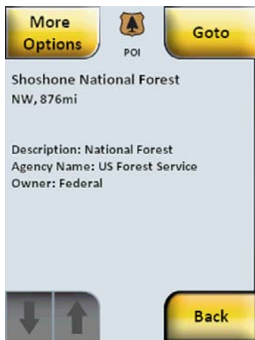
Endura Land Use Detail