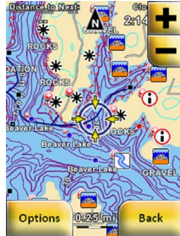
Lowrance Endura Fishing Hot Spots Screen Shots